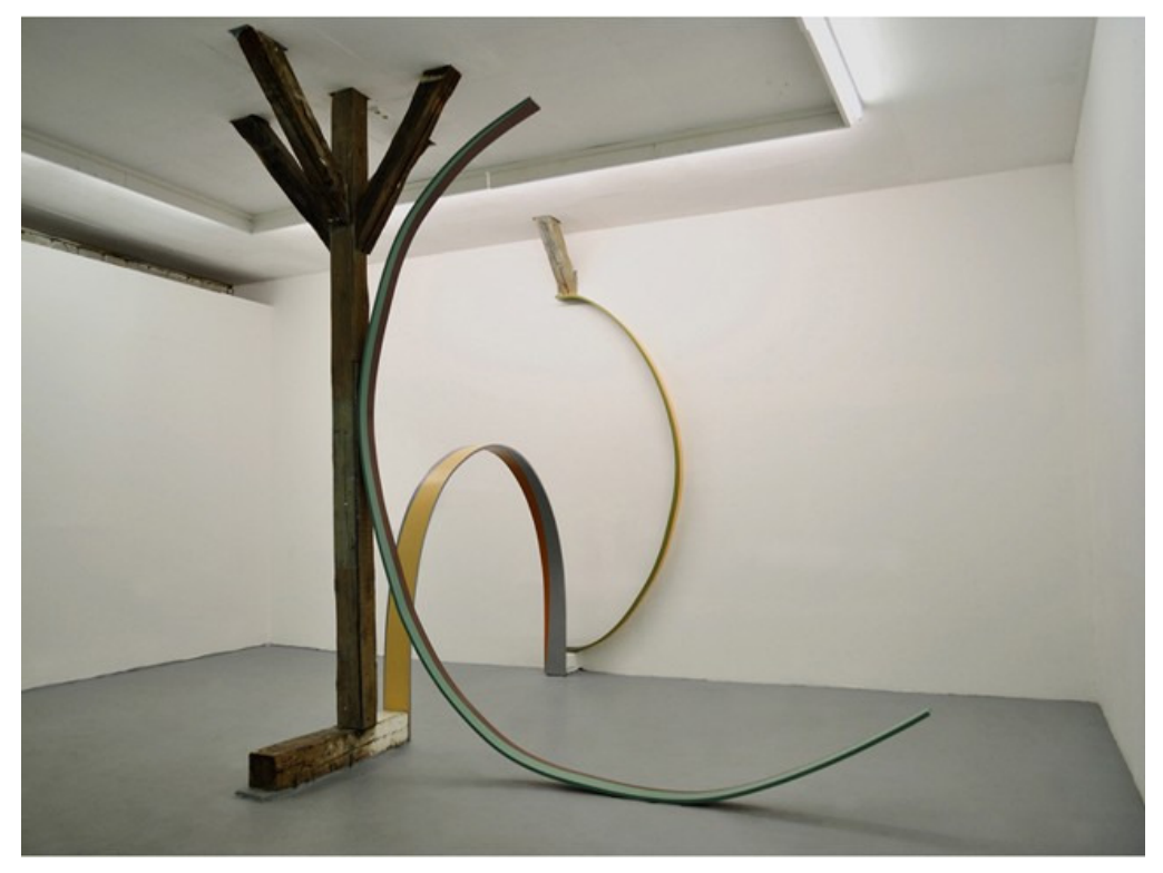
Maria Muñoz, Interruption, 2013, exhibition view, Kunsthalle M3, Mengerzeile, Berlin, Plywood, acrylic paint, acrylic lacquer, dimensions variable, 3 parts, © Maria Muñoz

Although graduate painter Muñoz abandoned the medium of painting, her approach to the three-dimensional work Interruption (2015) could be described as painterly. She works by means of painted lines and surfaces, but within the space. Interruption is a site-specific installation, which reacts to the given room. It consists of three bent and painted arcs of plywood. It defines the space in the new way, interrupts the orthogonal character of room and cuts it into pieces with the colourful slabs. The interrupted circular shapes of arcs attract our attention and ask for the completion. This need could be described, according to the Gestalt psychology, as the "law of closure". The similar optical illusions had been explored on the canvas by op-art, whose Chilean representative Matilde Pérez influenced the work of Muñoz. Muñoz's artistic inspiration stems from the Russian constructivism, abstract geometric art and minimalism. She constantly reevaluates them in her conceptual analysis of the space, which she began during her art studies in Europe.