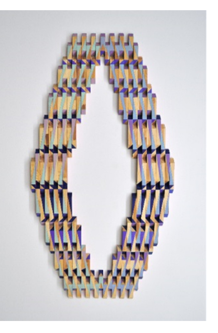
Maria Muñoz, Progression of Color, 2015, Plywood, wooden slats, acrylic paint, acrylic lacquer, enamel, 130 x 80 cm, © Maria Muñoz

In the Progression of Color (2015) Muñoz is playing with the boarders of two and threedimensionality. She performs that by means of a simple construction, which resembles at the first sight a wooden toy or a brain teaser. The placement of the work on the wall, usually reserved for the flat medium of painting, is challenged through the plastic forms of this rhombus. The wooden pieces were cut under the flat-looking angle. The prominent place is devoted to the colour, which opposes the flatness and brings the deepness through the graduated purpleblue hues. Progression of Color is not linear, it has neither beginning, nor end.